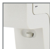
possibility of sealing