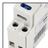
terminal capacity max. 2.5mm 2